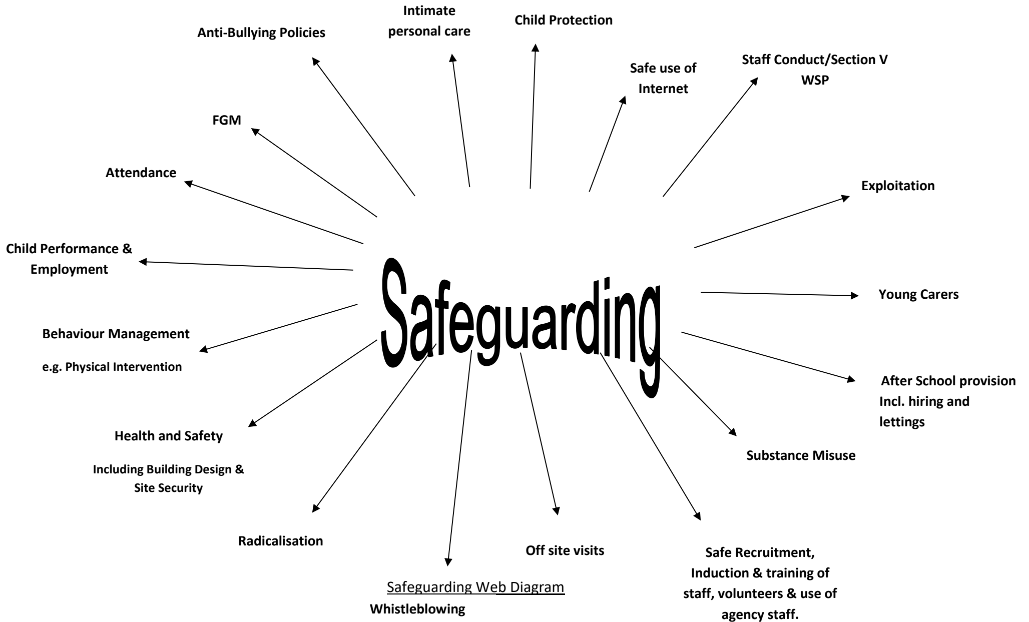
Safeguarding Web Diagram